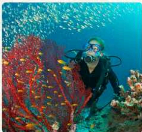
3 REEF SNORKELING