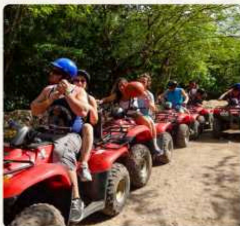
HIGHLIGHT BY POLARIS